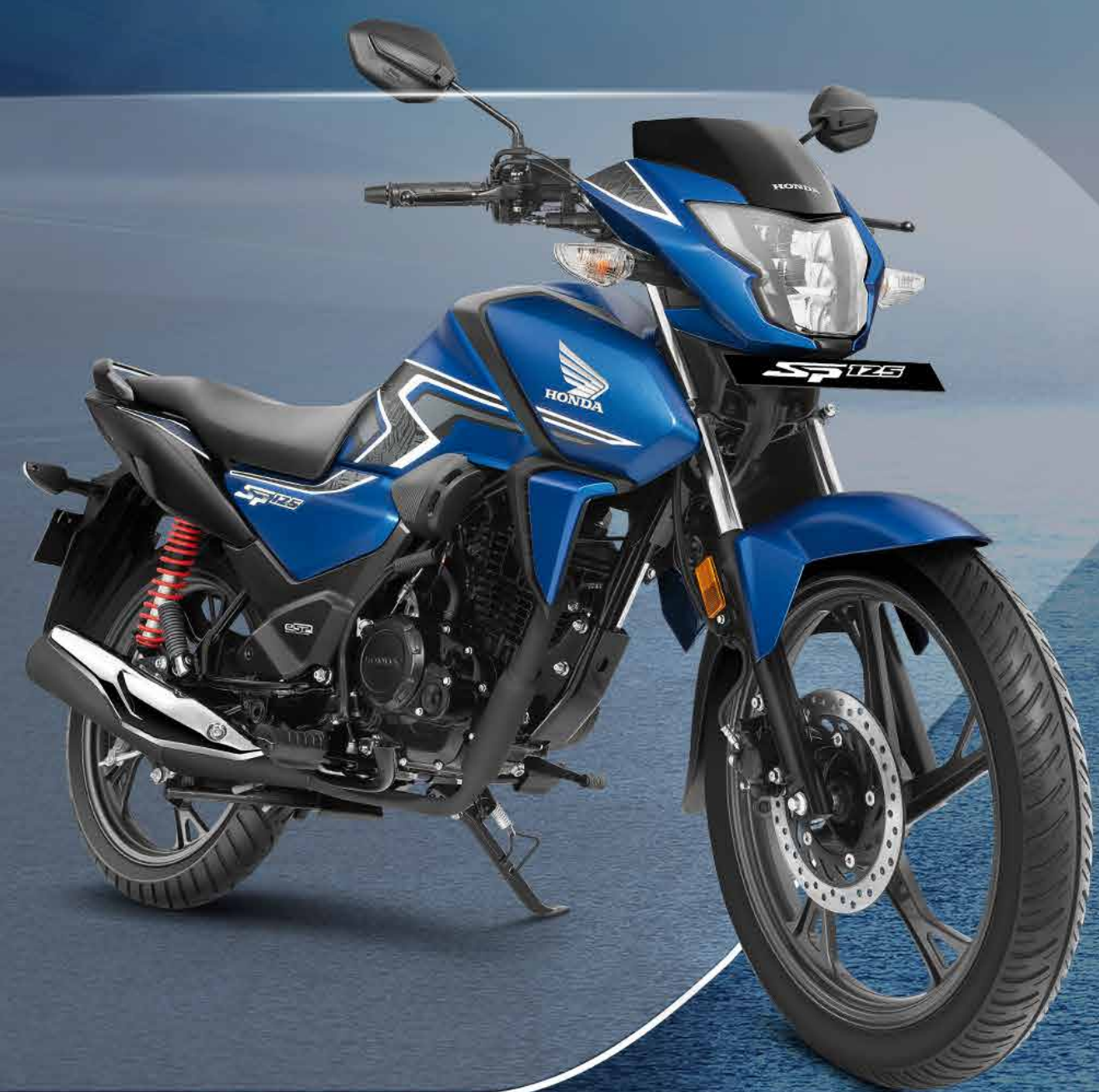
MAT MARVEL BLUE METALLIC