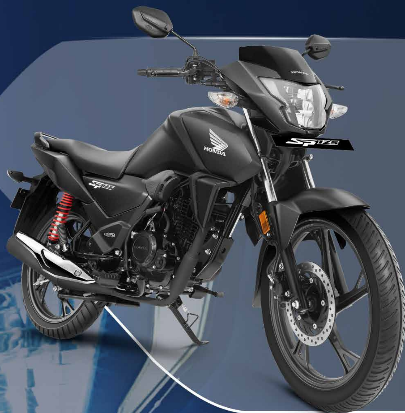
MAT AXIS GREY METALLIC